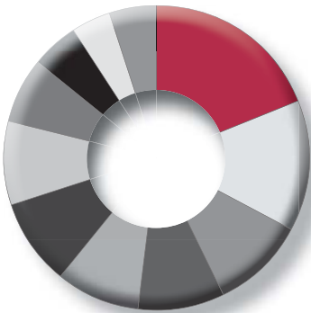
Delegates structure 2013 by job function